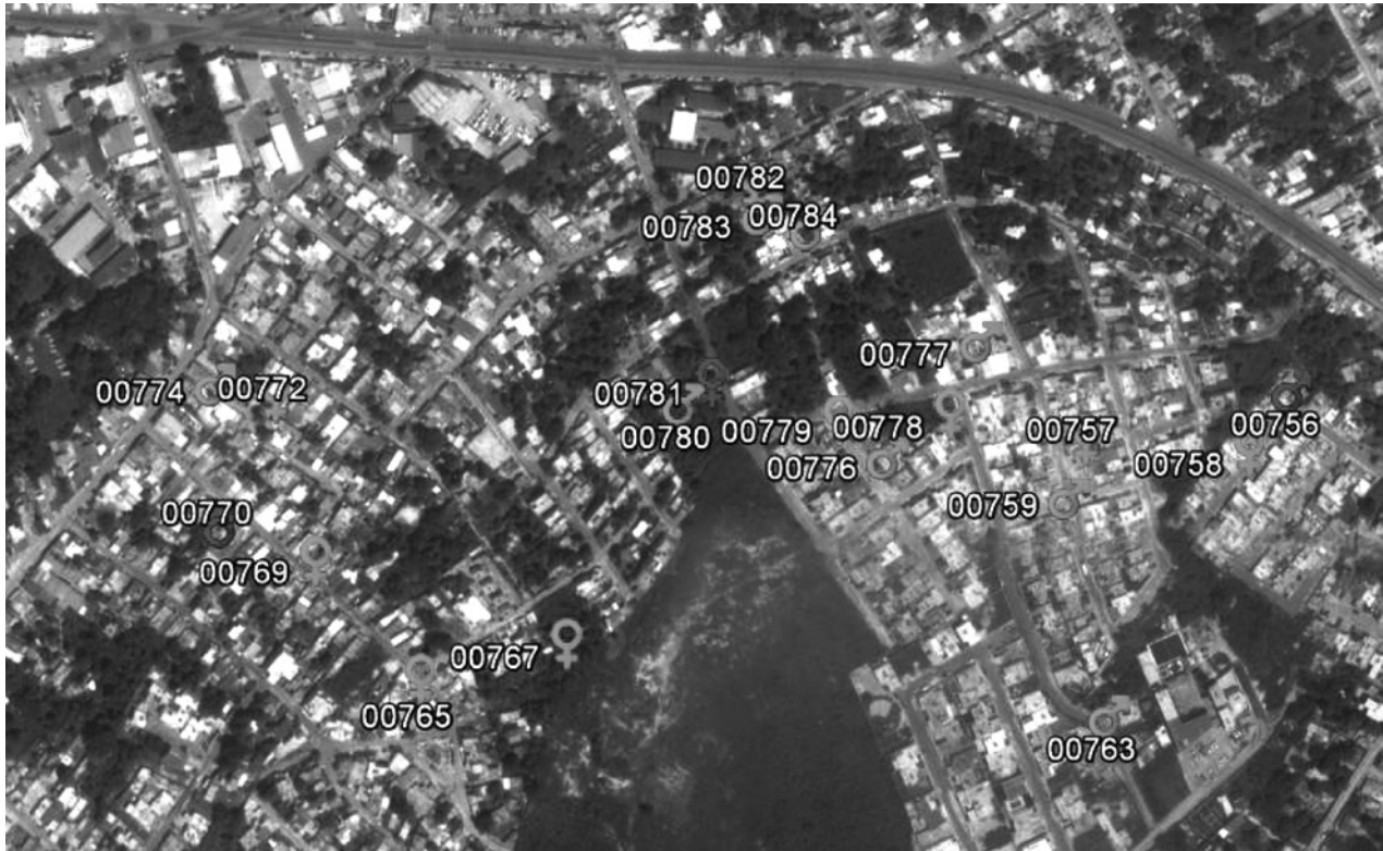
Figure 5. Image of fieldwork follow-up quality indicators, 2015 GATS Mexico

to projection of the population aged 15 years and above by region, area, gender and age group.